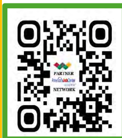
(QR Code Sample)